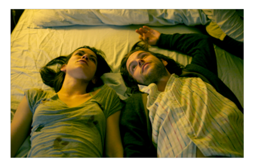
The American Devices