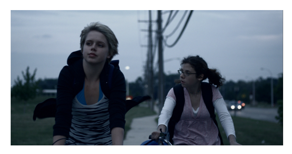
***OFFICIAL SELECTION: 2010 CANNES FILM FESTIVAL, INTERNATIONAL CRITICS' WEEK***