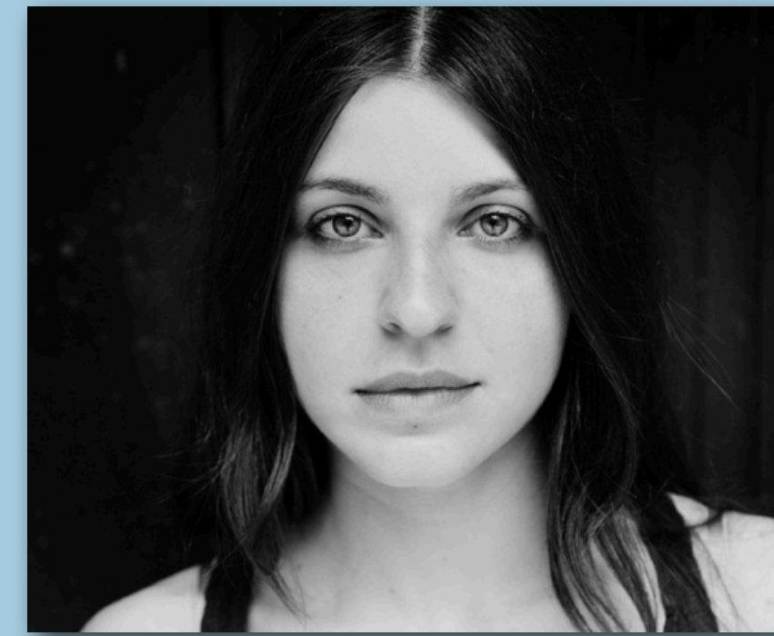
EVA BAY (ACTRESS)