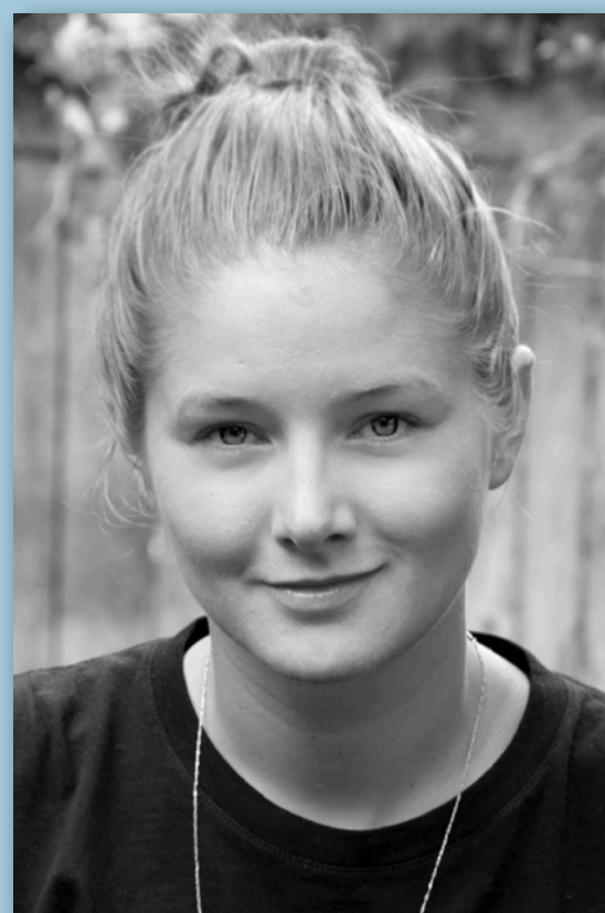
LISA GLOCK (SCREENPLAY)