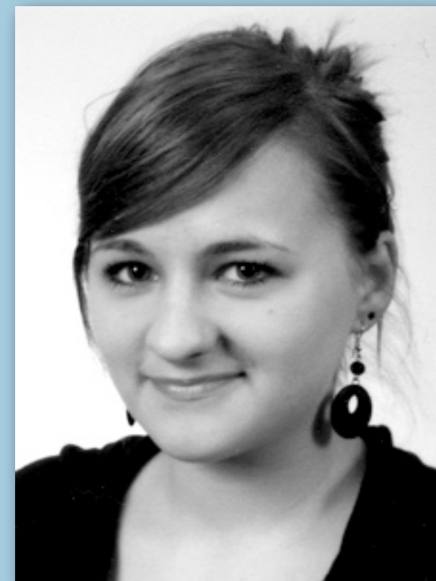
TINA LASCHKE (SOUND)